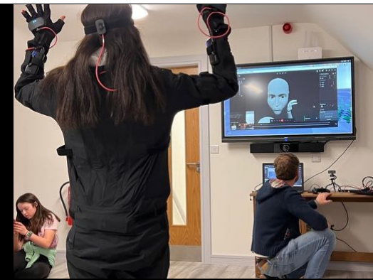
New processes: INO