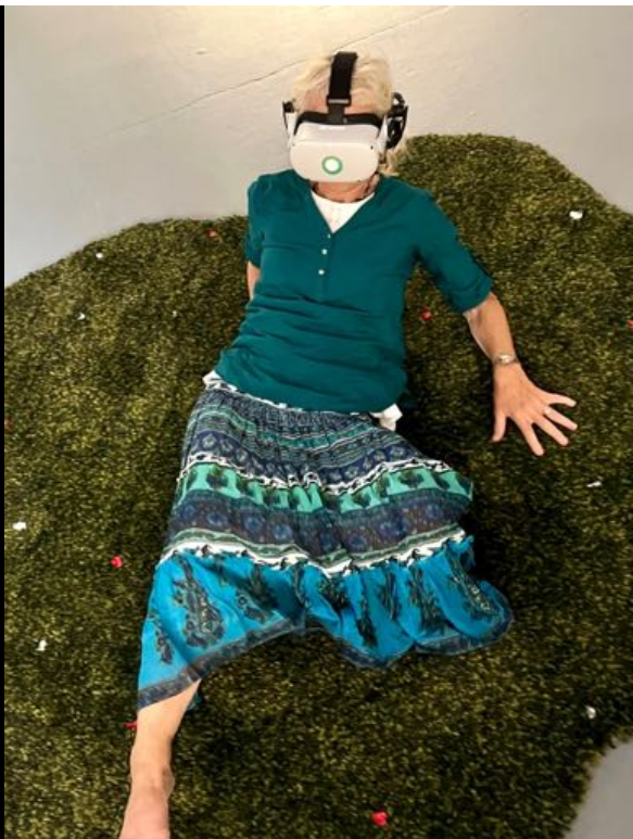
New forms: INO