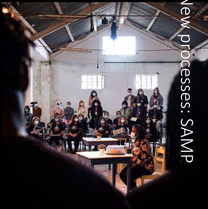
New processes: SAMP