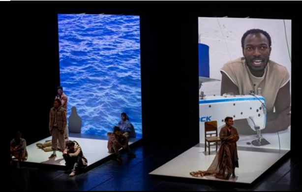
New forms: SAMP